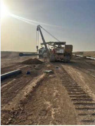
EBS PETROLEUM · 2025 S2/S Oil Trunkline EPCC Current flagship — 55 km of 10"-18" trunklines, East Baghdad South · $19.99M