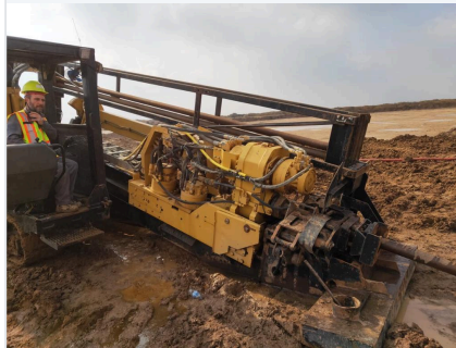
PETROCHINA · 2018 Flow Lines & Trunk Lines Engineering & construction programme, Missan · $9.29M