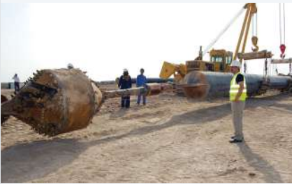
NSGC INTERNATIONAL · 2012 Siphon of Shatt Al Arab Landmark civil & pipeline crossing, Basrah · $16.02M