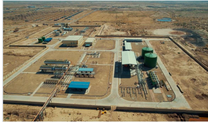
CNOOC IRAQ · 2018 Water Injection Stations EPCC Buzurgan Oilfield, Maysan · $34.6M — largest single contract