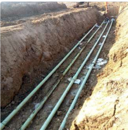
DAQING PAB · 2022 GRE Pipeline Tie-Ins 110 km of 6" & 20" GRE pipeline to well pads