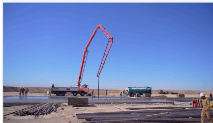
CNOOC IRAQ · 2022 Well Pads — Eighth Batch Civil construction, Missan Oilfield · $3.81M