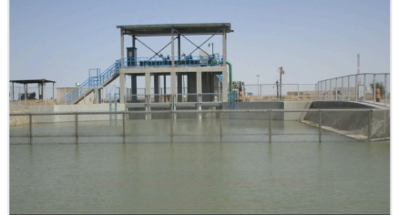
CNOOC IRAQ · 2014 New Intake Water Pump Station Full EPCC delivery, Missan Oilfield · $16.68M